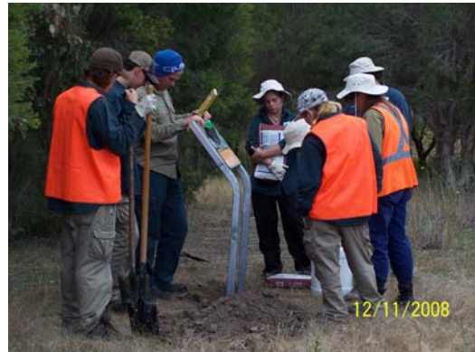
Some of the Green Corp members busy installing an interpretive sign

Six of the smaller interpretive signs were placed around Magenup Lake over November. These were installed by a team of "Green Corp." volunteers who also did a great job clearing out the weed growth around this year's seedling planting. The weeds were especially bad around the second planting and now the seedlings now have some growing space. We can hope that with these late November rains their chances of survival will greatly increase. For some horticultural training, a large number of Jointed Rush cuttings were collected and potted on at Ngulla Community Nursery and these will be planted out next year after the rains as they like wet feet. With any luck these will start a new patch out on the Magenup Lake area.