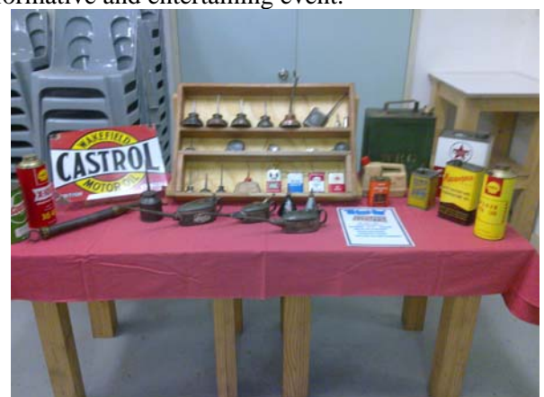
The Oil Can Collection

Our November meeting started with our annual sausage sizzle to mark the end of another year. Then with our cuppa and bickies we were treated to a display of old oil cans brought in by one of our members, Russell, an avid collector. Apart from the oil cans you’d expect to find in a shed there was also an oiling pump from WA Railways and an oil container from a .303 rifle. It was a very interesting and enjoyable display with some items bringing back old memories and lots of discussion amongst members. Our next meeting: 7:30, Thurs 27 th Jan at "The Shed", Wandi Community Centre, DeHaer Road Wandi. Hope to see you there.