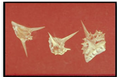
The spiny burrs of Caltrop

At the recent AGM a resident expressed concerns about the increased proliferation of Caltrop in the Wandi area.