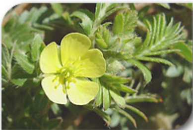
Caltrop flower