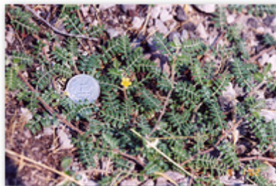
Caltrop Photo Molly Elizabeth Bagley 2001