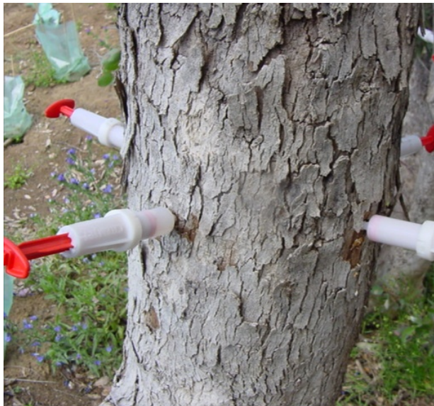
Flooded gum receiving Phosphite injection.