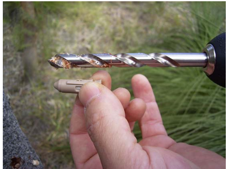
Preparing to apply a nutrient implant.

Landholders reported an increase in condition for a greater percentage of the marri, flooded gum and banksias treated with nutrients, flooded gums treated with phoscap, and Tuart treated with zinc compared to the control trees of the same species. Phosphite injection, and iron implants on Jarrah appeared to slow decline, with a decrease in condition recorded for a smaller percentage of treated trees compared to control trees. Individual tree response to treatment varied, due to a range of environmental variables, including soil condition, pathogens, and insect attack, as well as individual tree characteristics, including species, tree condition, resilience and sap flow.