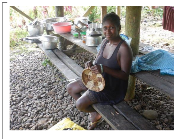
I don't think the ladies do any carving, but they do lovely basket work. We have a sample of their work.