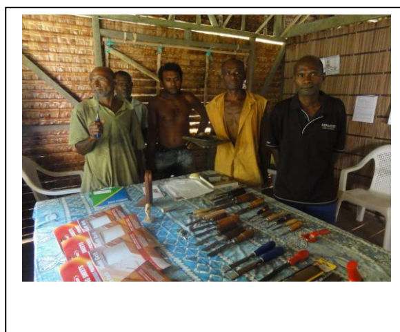
Some of the Biche carvers with tools donated by the club