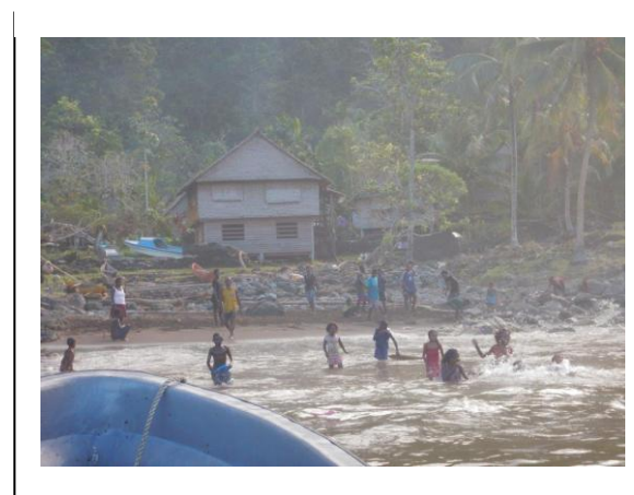
You can go to Biche, and stay in this beachside villa. Paradise, but no electricity, running water, TV, phones or internet