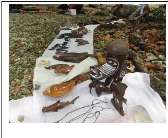
Some of the beautiful work the Biche carvers can do