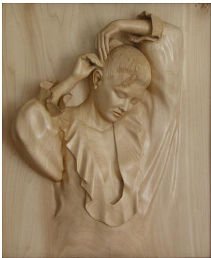
Relief of girl-European Lime

While these carvings need much more equipment and specialist tools, his regular classes at the local Adult Education College and the Arts Centre are based much more on what can be done with much less financial commitment. At the Arts Centre his classes are held in a classroom with only tables and chairs so everything is based around knife carving with every class being oversubscribed.