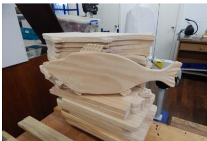
A shoal of fish