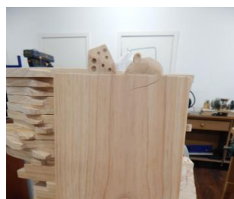
Trusty cheese board